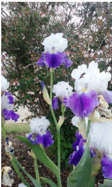
Show-class three foot irises

"Thank you, I enjoyed this course so much! ( Walkin' the Walk )