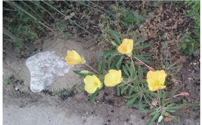
In our "Arboretum" - Night bloom dainty yellows