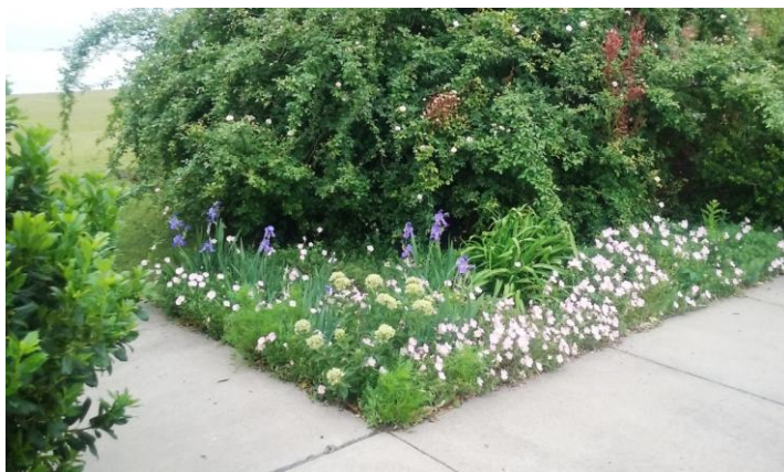
A corner with primrose, milkweed and a large rose bush!

Please pray for eight of us attending the Emmaus International Prison Conference in Dubuque, IA on May 29 – June 3