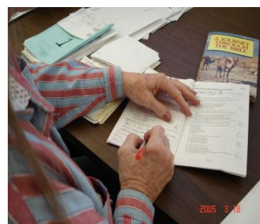
Grading and posting 900 courses per week.