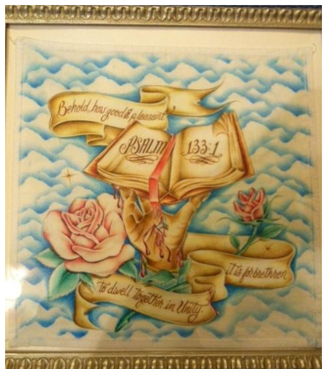
Prison Handkerchief Art