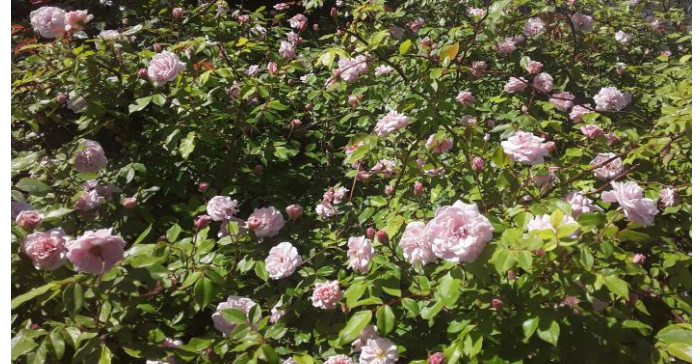
WPM garden roses